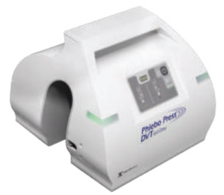
Phlebo Press® DVT 650 Easy