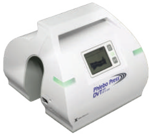
DVT 603 All in One