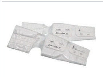
4-chambers Calf and Thigh