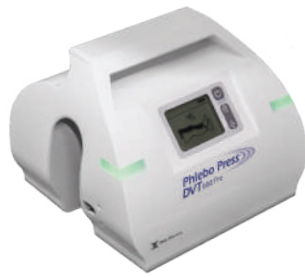
Phlebo Press® DVT 660 Pro