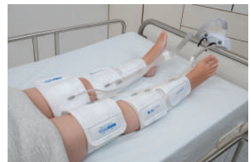
4-chambers Calf and Thigh