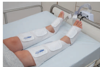
4-chambers Calf and Foot