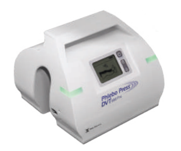
Phlebo Press® DVT 660 Pro