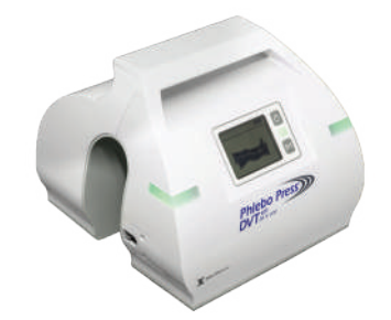
DVT 603 All in One