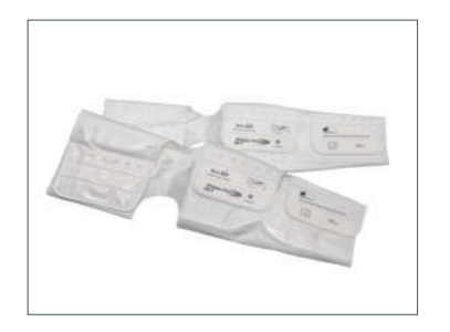
4-chambers Calf and Thigh