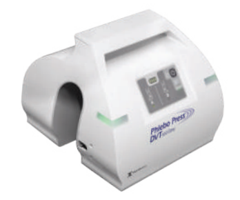
Phlebo Press® DVT 650 Easy